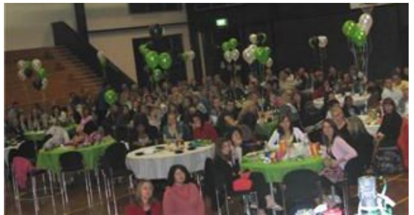
The Nutbush. Nice to see a few dads up there